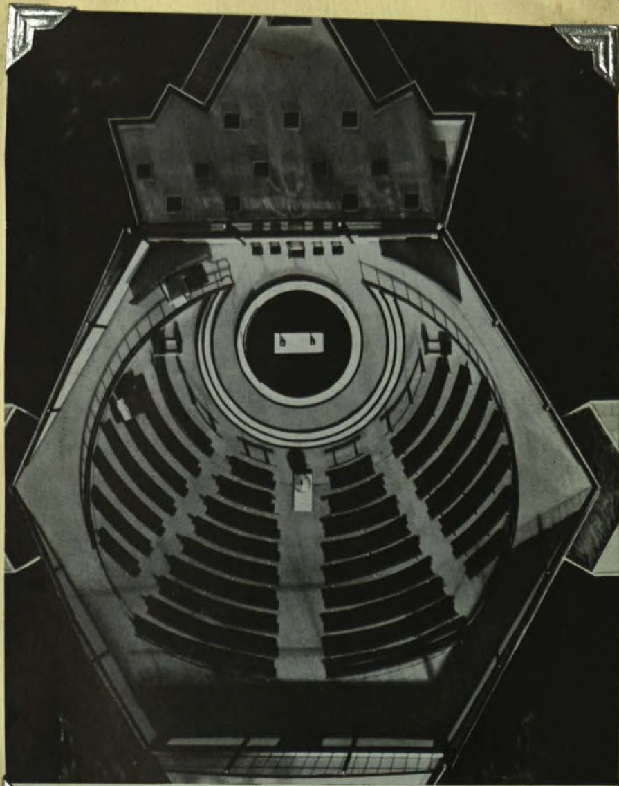
Lincoln's church of tomorrow