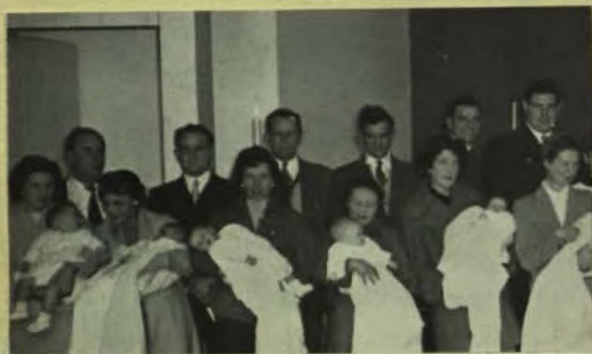
107 babies were baptised last year

There are many services and helps available to elderly people through the Council and the Church Representative would help to co-ordinate these services, e.g. meals on wheels, free outings, food parcels, etc.