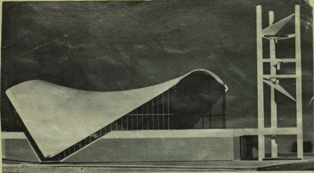
St. John's Church, Ermine