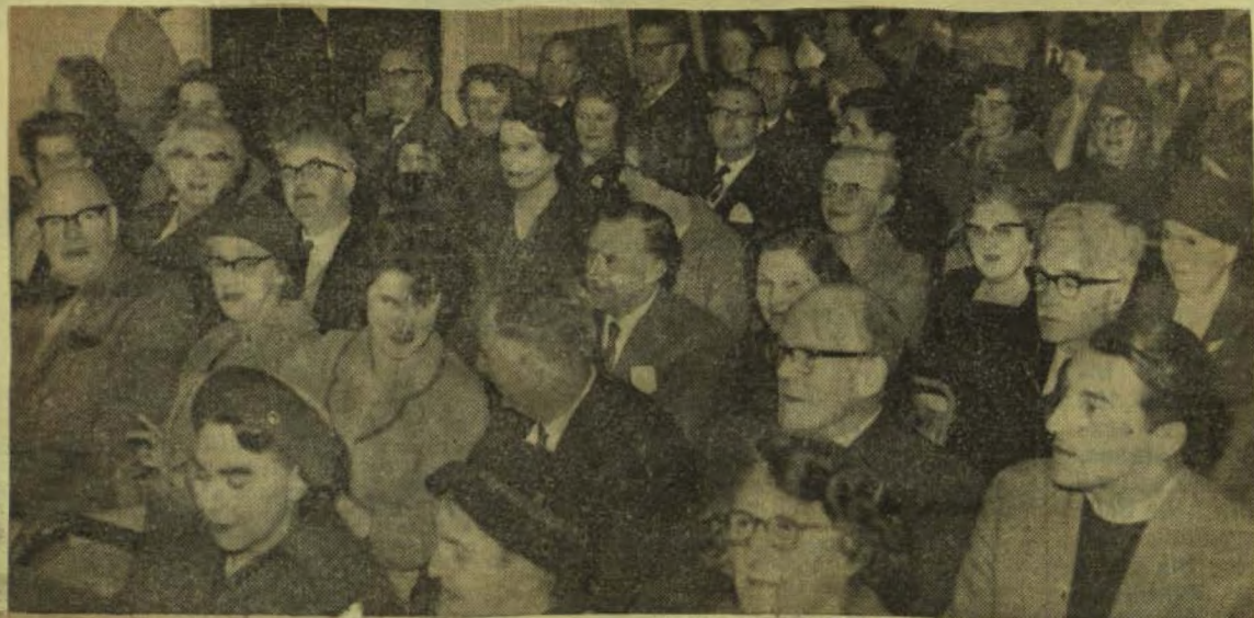
'Chronicle' photographs taken at the Deanery of Christianity Church Councillors and Church People's Conference held in connection with the mission to Lincolnshire, at the Bishop Grossetete College, Lincoln.